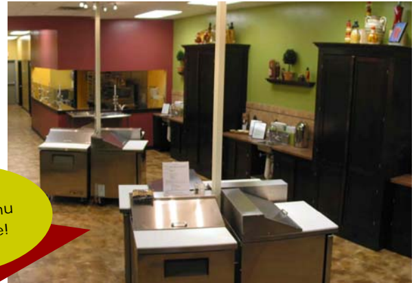
The Food Experience™ kitchen is ready to help you tackle your dinner time and upcoming holiday needs!!